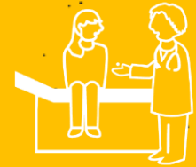
Medication Assisted Treatment