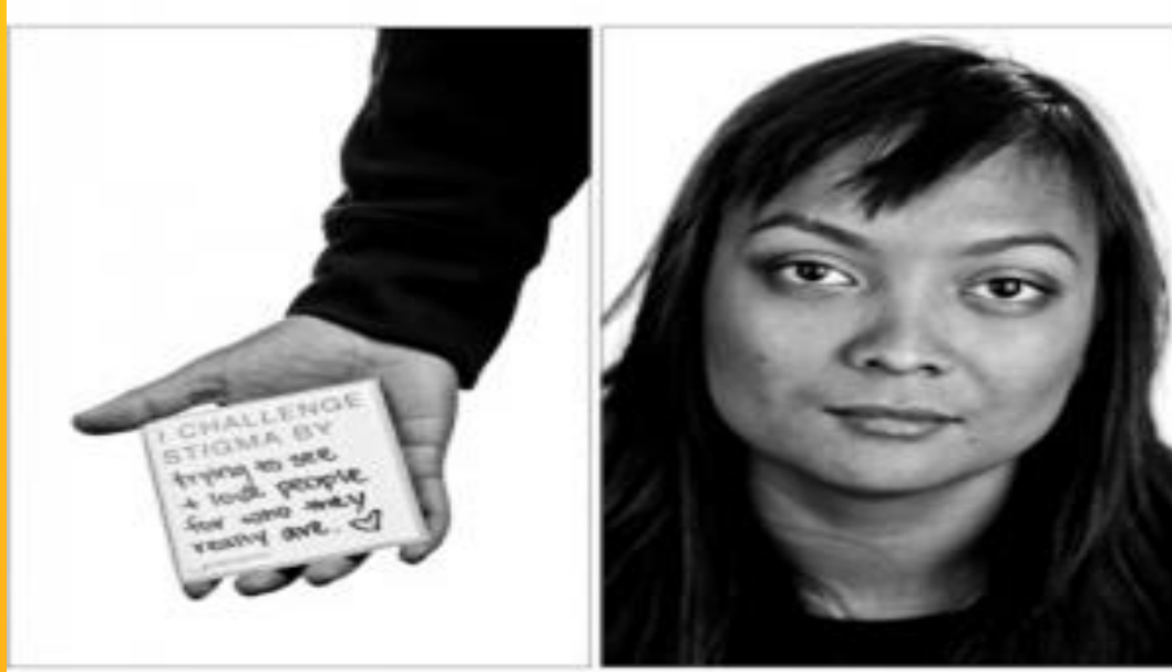
Harm Reduction Portraits