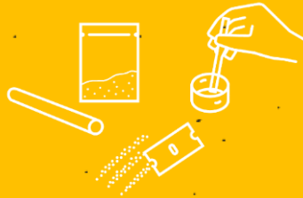
Safer Drug Use